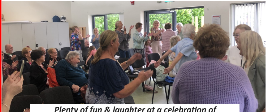
Plenty of fun & laughter at a celebration of Glasmore Park & Windmill Lands residents

We make this our prayer through Christ Our Lord. Amen.