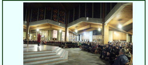
Congratulations to the pupils of St. Cronan's SNS who took part in the Diocesan 'Laudate' music festival this week