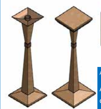
Ambo €3,840 Altar €7,860