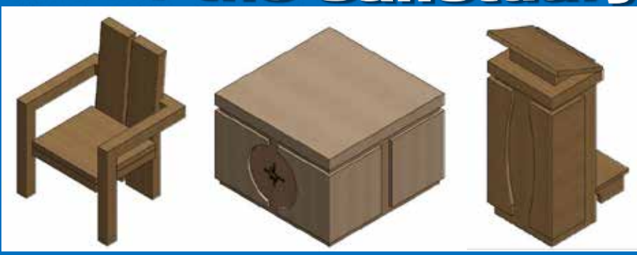
Chair €3, 260

The next project that we will be moving onto is the reconfiguration and replacement of the benches.