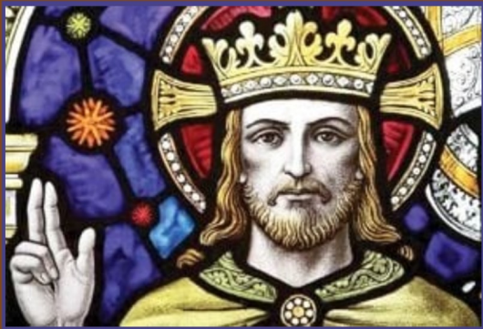
OUR LORD JESUS CHRIST KING OF THE UNIVERSE

In less than a week's time, we will go to the polls to elect representatives to the next Dail Eireann, which will hopefully lead to the formation of a new government. In the light of the recent giveaway budget, it is disconcerting to see the various parties outdoing one another with election promises that the Irish Fiscal Advisory Council has previously warned may not be fiscally prudent. It is to be hoped that the electorate may not simply vote for the party or individual that offers the most for their particular sectoral interest but may be guided by what is best for the country as a whole, for vulnerable minorities, for future generations, and for the future of our planet, what the Church in its social teaching refers to as 'the common good' .